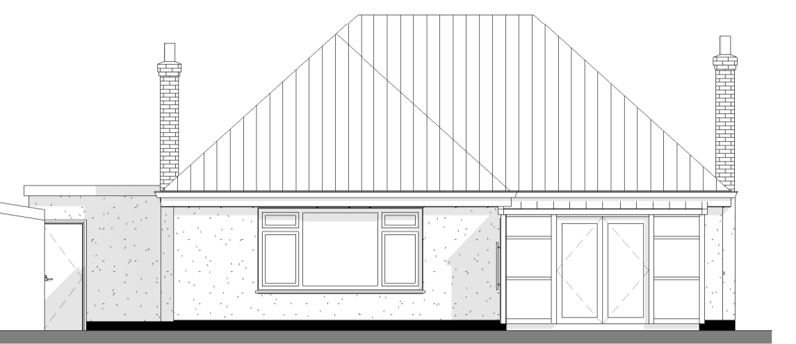
3 Existing Elevation - Rear 1 : 100