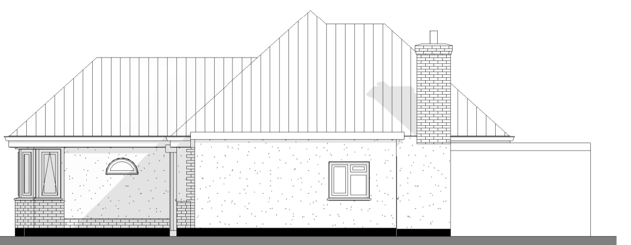
4 Existing Elevation - Side 2 1 : 100