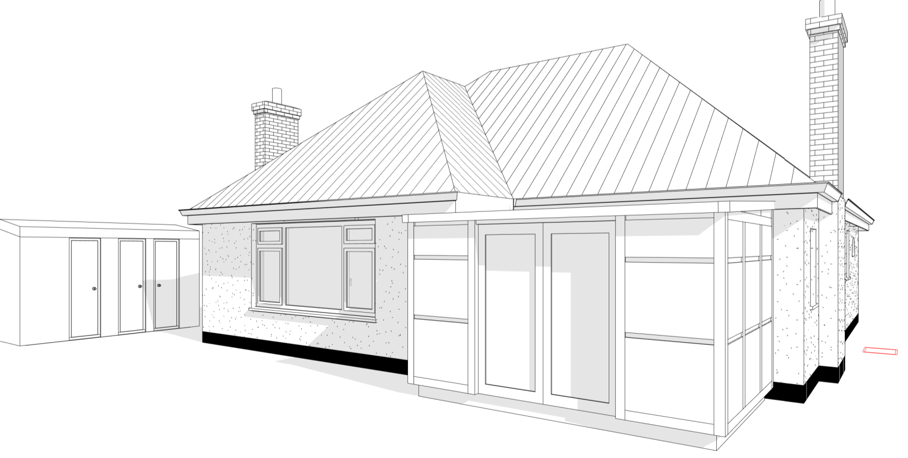
8 3D View 6