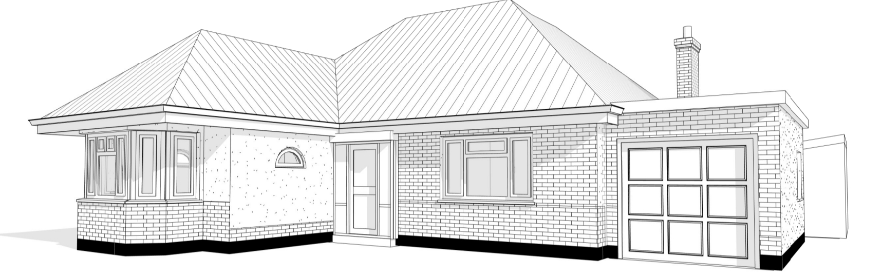
7 3D View 3