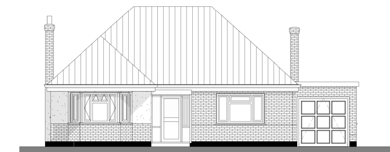
1 Existing Elevation - Front 1 : 100