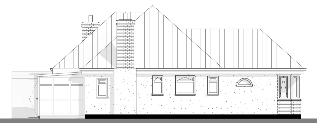
2 Existing Elevation - Side 1 1 : 100